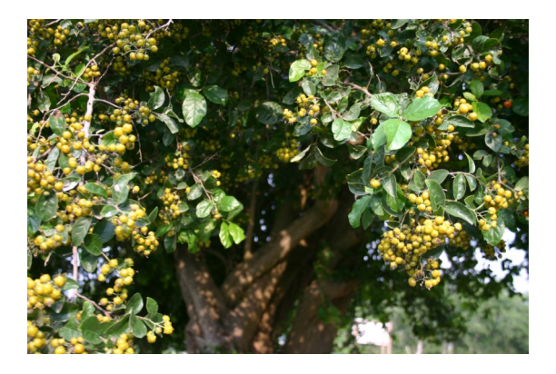
Common Names: Sandpaper Tree, Knock-Away, or Birdberry Tree

It is mostly evergreen, but don't be surprised if it loses a few leaves in the winter.